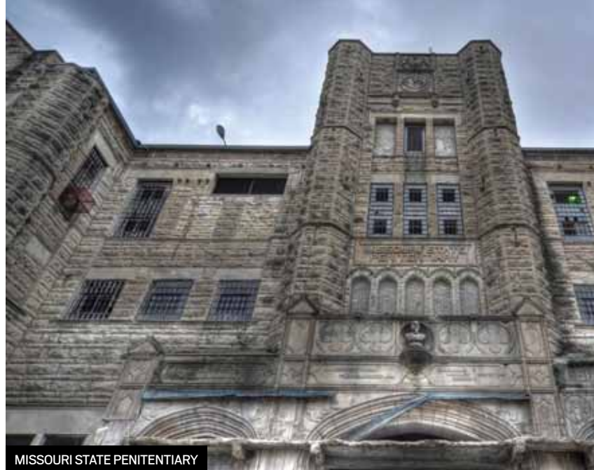
MISSOURI STATE PENITENTIARY