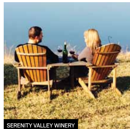
SERENITY VALLEY WINERY