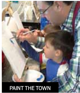
PAINT THE TOWN